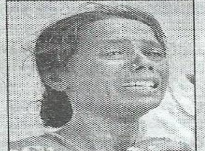
Mother of Venkatesh