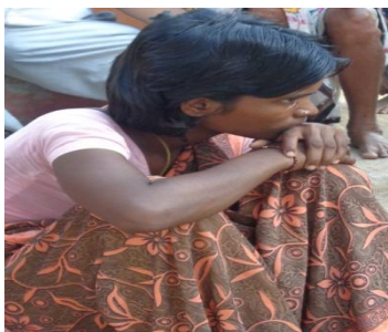
Wife of Siva