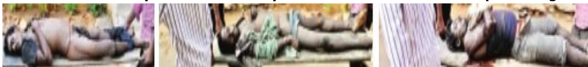
Bloated and un-clad bodies of the three DNTs killed near Tirupathi, before postmortum

③ Three Denotified Tribe (DNT) Youth of the Vanniyar community, all below 30 years were killed after arresting and torturing and later stage managing the show of 'encounter', by throwing the bodies on the rocks located in the forests and by placing the kit bags and weapons. All three are from the Daniyar Attamoor a village located at the bottom of Javadi hills, Porur Tq, Tiruvannamalai dist. 29-5-2014 is the date of death given by the police.