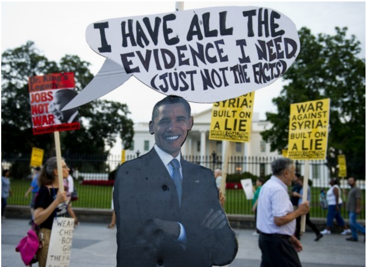
A cutout of US president Barack Obama stands on the sidewalk as demonstrators march in Lafayette Park on August 29, 2013.