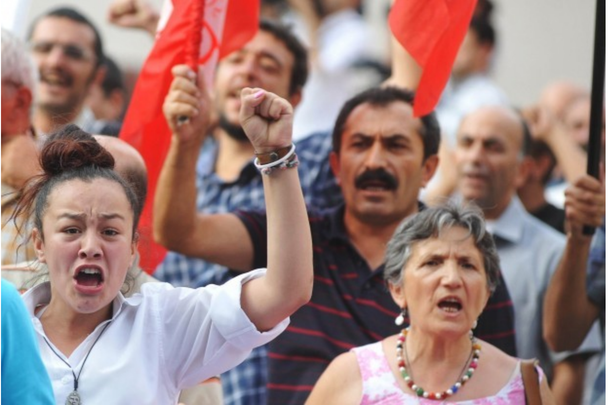
Turkish trade union activists protest against a potential US military intervention in Syria, in front of the U.S. embassy in Ankara, on August 30, 2013.