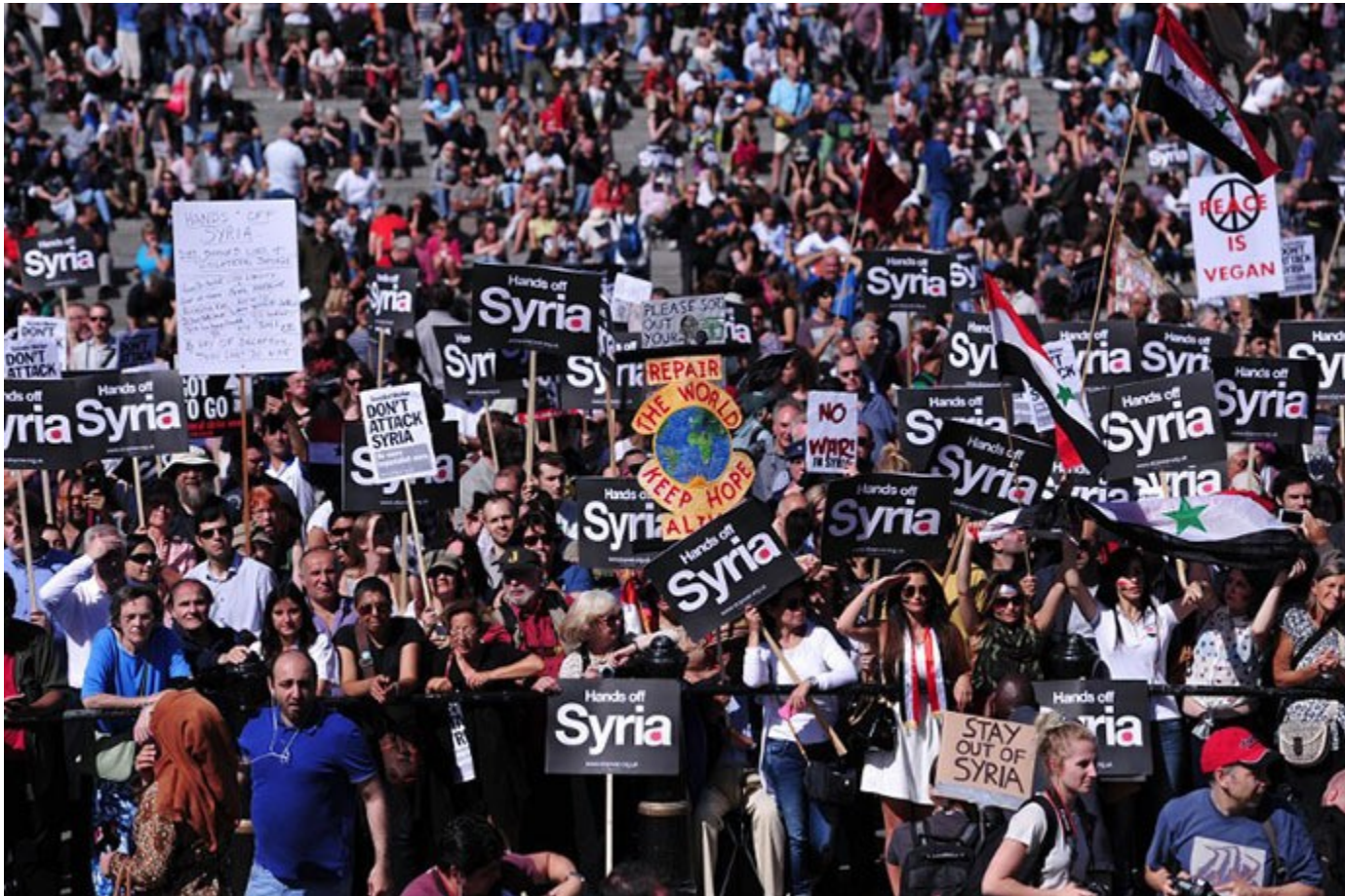
The London anti-Syria War-rally on August 31, 2013.

intervention will only prolong the Syrian civil war.