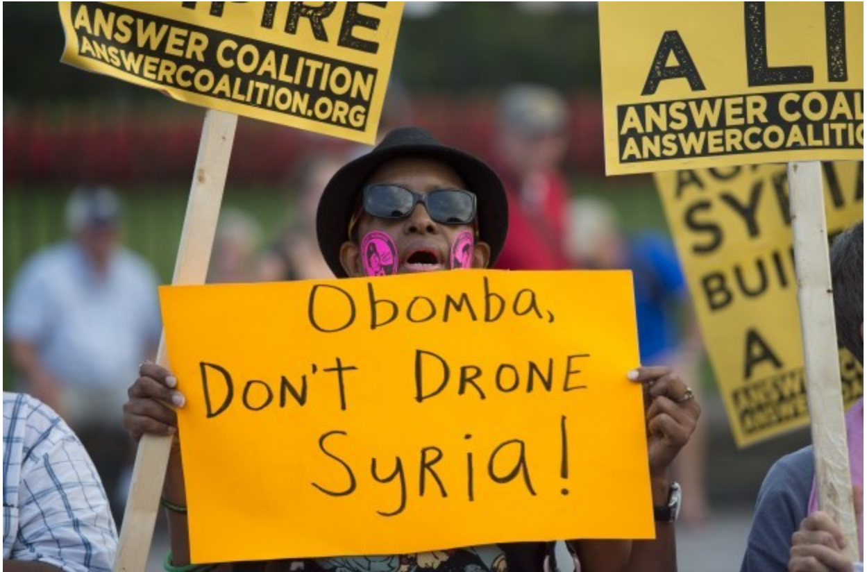
Demonstrators in a rally in Lafayette Park in front of the White House on August 29, 2013.