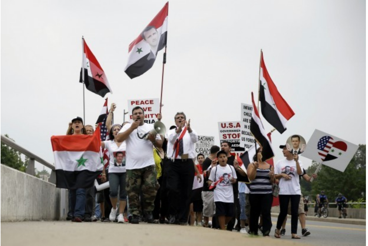
Members of the local Syrian community march in protest against the US involvement in Syria on Aug. 30, 2013, in Allentown, Pa.