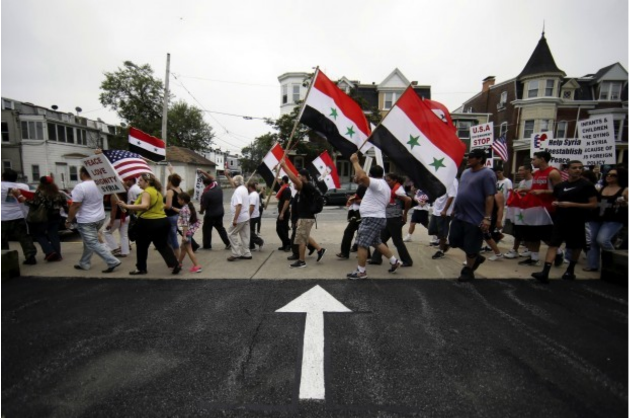
Members of the local Syrian community march in protest against the US involvement in Syria on Aug. 30, 2013, in Allentown, Pa.